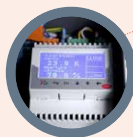
ELECTRONIC EXPANSION VALVE